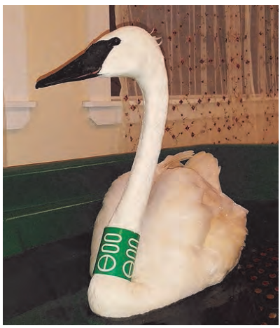
After being shot in October, 2016, "Hope" spent months in rehabilitation at Native Bird Care in Sisters, Oregon, to heal her injured wing.

Our thanks to the Oregon Department of Fish and Wildlife (ODFW) for their commitment to her rehabilitation and to Native Bird Care in Sisters, Oregon for their care of this special bird. The Oregon Restoration Project is a partnership between TTSS, ODFW and the U.S. Fish and Wildlife Service. *