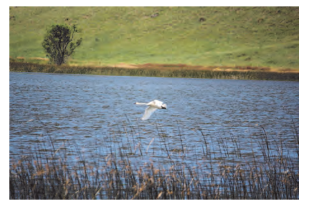
Trumpeter Swans in the Sandhills of Nebraska are being monitored for breeding success.

If you'd like to donate to the NASF to fund worthwhile projects like these, use page 7, or mail a check, payable to TTSS, memo: NASF