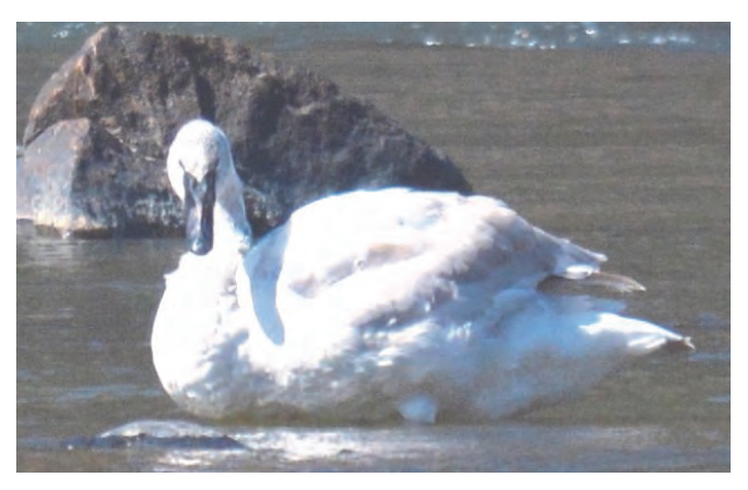
Several people spotted this Trumpeter Swan near Ledges Park in North Carolina and reported it to TTSS.