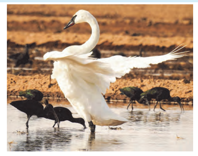
Above: The Arizona Bird Committee confirmed a Trumpeter Swan sighting in Arizona, near Buckley.

Keep those observations coming, folks! •