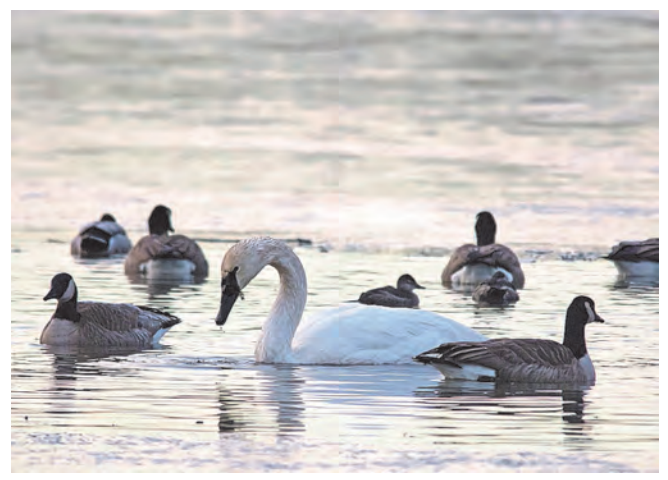
Above: This Trumpeter Swan has been seen near College Park, Maryland for the past several years. It spends the winter. Its mate was last seen a couple years ago.