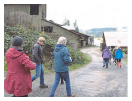
Six farms were toured on the field trip. Lure crops, assessing crop damage, and the latest in dairy farm improvements were showcased