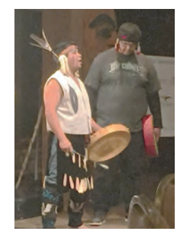
The Tzinquaw dancers enthralled the Banquet attendees with their rich cultural heritage