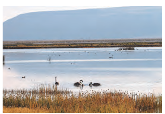
The recently released cygnets from Sunriver Nature Center and Aspen Lakes Golf Course are doing well at Summer Lake Wildlife Area in late fall.

Early this year, only one male and three female adult swans remained on the refuge. This summer the only breeding male went missing. Also one of the females could not be found, leaving just two known females there.