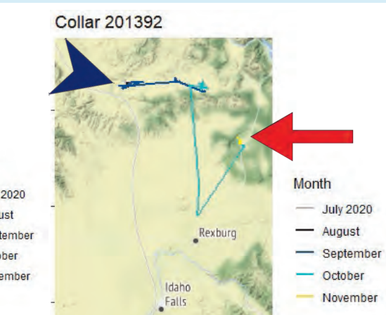
Above: The other swan moved away from Lima Reservoir and out of cell tower range in late August. As of early December it is at Idaho's Harriman State Park.