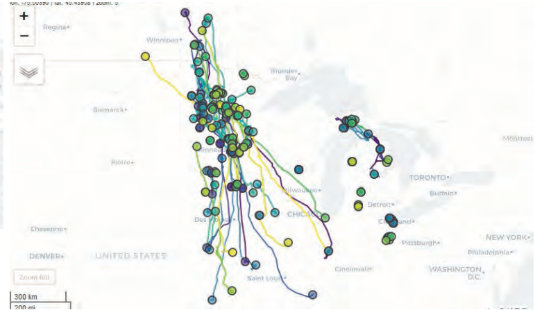
Above: November 28, 2020. Migration began in late October. By late November, some swans in Iowa, Manitoba, Minnesota and Wisconsin were in other states. Michigan and Ohio swans remained in their states through late November.

Her last report and photo of swan 0H in Manitoba was October 10. By late (red arrow).