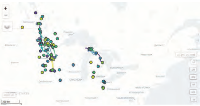
Above: September 7, 2020. Most swans are still at their summer 2020 capture locations.

Exciting news about flock connections! By early December, Loess Bluffs National Wildlife Refuge in Missouri has six GPS swans: four swans from Minnesota, one from Iowa, and one from Manitoba!