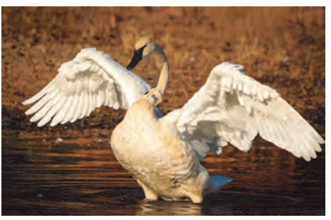
Minnesota swan 8E arrived in Heber Springs, Arkansas from Minnesota flying 700 miles in 12 hours.

"At around 7 p.m. it took off from there and made almost a direct path down to Arkansas, covering about 700 miles in 12 hours. The flight averaged ~55mph over the entire time, didn't appear to dip below 45mph at any point, and (if the sensor data is accurate), hit a max of 75mph. There was a fairly strong tailwind from the northwest which helped a lot I'm sure. The swan arrived in Heber Springs area the next morning, November 30 around 7:30 a.m."