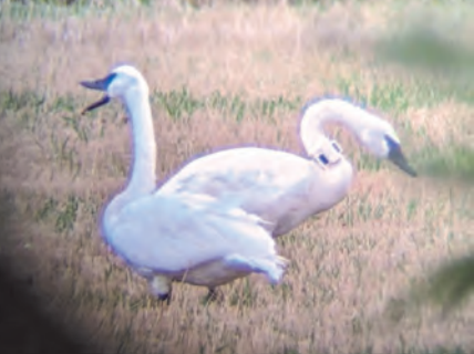
Left: Wisconsin swan 0P was reported in southern Indiana in early November. Middle: Manitoba swan 1H flew to Minnesota in late September and was at Loess Bluffs National Wildlife Refuge in Missouri by late November.

The Midwest swan tracking project is already giving new information about swan behavior during fall migration. Thank you for your support of this valuable partner project (pg 2) and for supporting Trumpeter Watch.