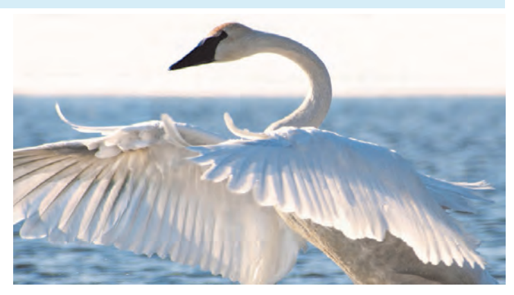
Above: © Richard Sonnen photo

Star of beauty, and all white who won the extinction fight. You can hear it honk in night The trumpeter swan, in flight, its wings of wonder and might, angels with souls to delight The trumpeter swan, the perfect light.