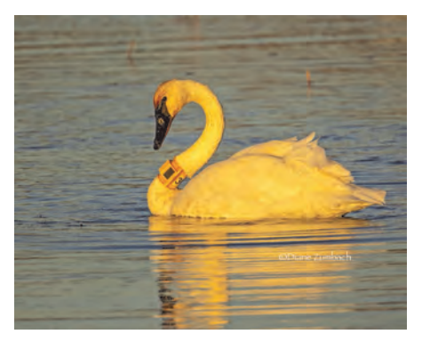
Iowa swan 3C has remained in its summer area which is also a wintering area for other swans.

"The flight path for this swan was pretty impressive. The swan had been hanging around within 30-50 miles of its summer area for the last few weeks. Then it bumped down to near Monticello, Minnesota Sunday afternoon (November 29)."