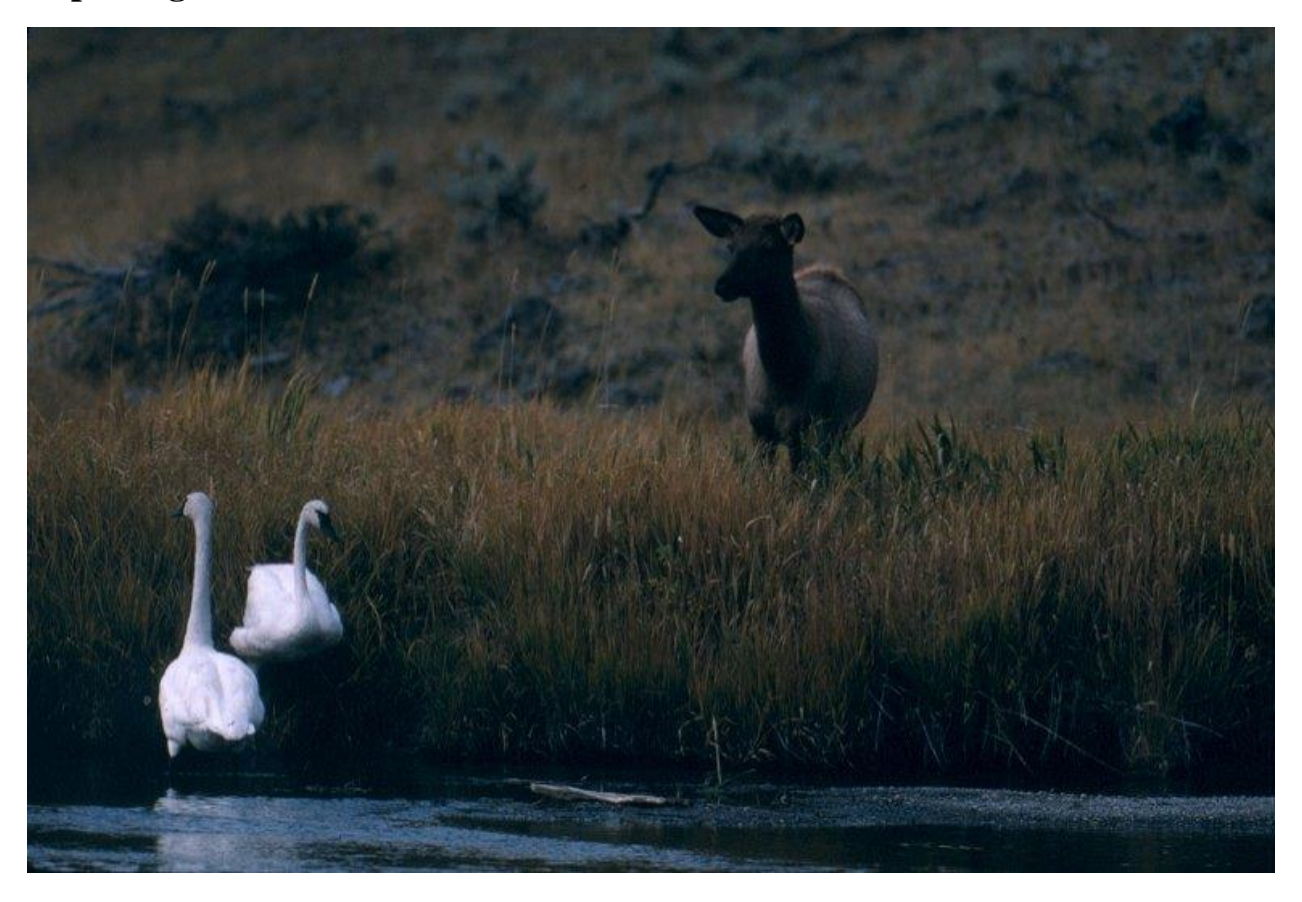
Field Trip October 26, 2022: Exploring Jackson and Grand Teton National Park

Above: Elk and Trumpeter Swans.