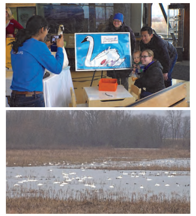
Above: Riverlands Migratory Bird Sanctuary in Missouri is one of the Midwest's important swan wintering areas.