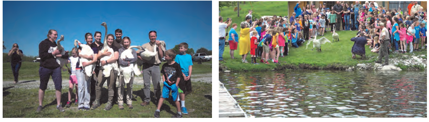
Above: Iowa's spring swan releases include cygnets from zoos. Hundreds of local students participate each year

Our original goal was to have a completed film by 2016. However, life goes on while we're busy trying to plan it.