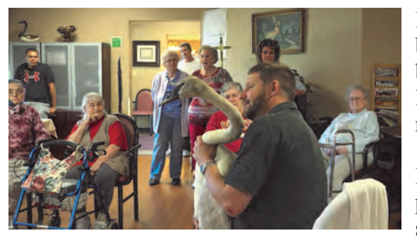
Above/below: Iowa's Department of Natural Resources public outreach and education programs use Trumpeter Swans to "Trumpet the cause for wetlands" and reaches people of all ages.

It was those three simple words that led me and my wife Char on a mission: a wildlife documentary on Trumpeter Swans.