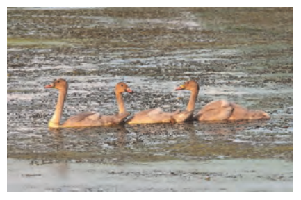
Three cygnets survived to fledge at "Swan Corners" in Michigan.

After they left the corners, I was driving by as is normal on my way to work – wondering where they had gone when in the beautiful morning sun some movement caught my eye. There, about 50 feet off the ground, flew the entire family in perfect formation with mama and daddy leading the way. What a sight to see!!! Keep up the good work! *