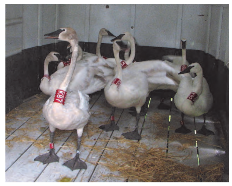
Left: Trumpeter Swans did not struggle when held securely in the arms of volunteers. Right: The red-collared swans are ready for transport to a nearby reservoir for release in the Flathead Trumpeter Swan restoration project.