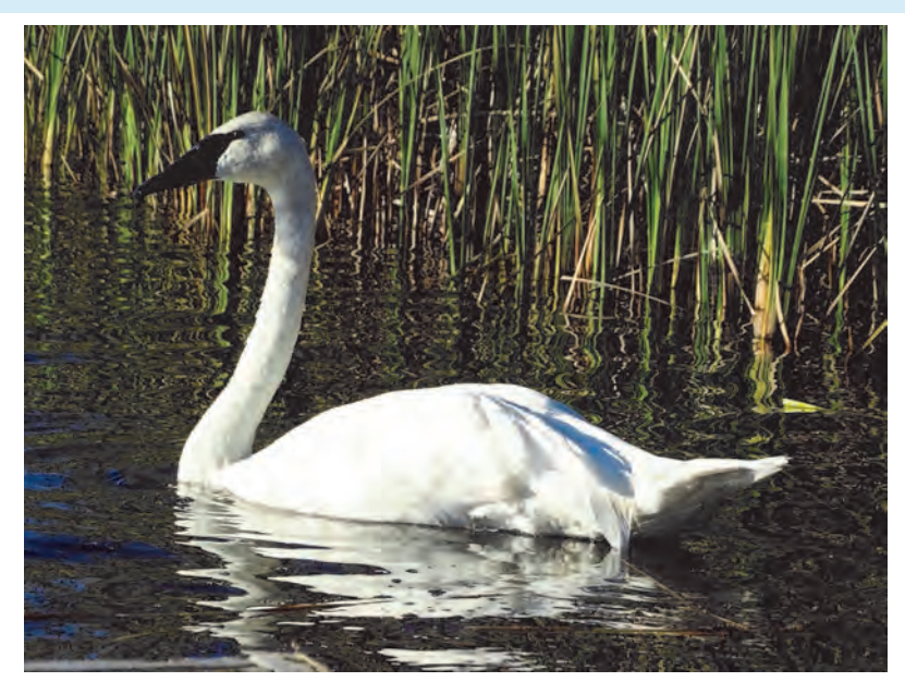
"Mac" the 20 year-old cob at the Mac Johnson Wildlife Area in Ontario.