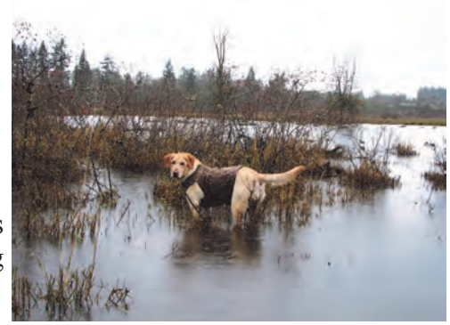
"Boomer"

While Boomer and I were sharing my lunch, we heard a raucous cacophony ascending upon our blind. I thought we were being approached by a warming up middle school band trumpet section.