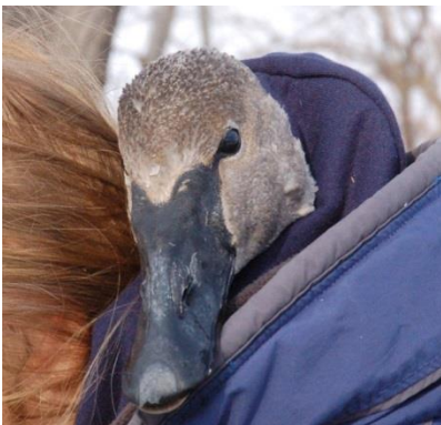
3. Above: the same cygnet was rescued by volunteers. It was taken to a wildlife rehabilitation center where it died 10 days later of lead poisoning, caused by a fishing sinker.