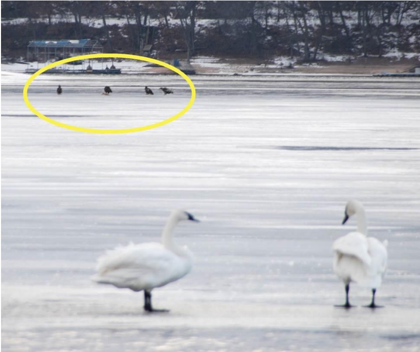
11. Above: An eagle feeds on the carcass of a dead swan that had died a couple days before, while other eagles wait to feed on the carcass as well. Lead poisoning is moving up the food chain.