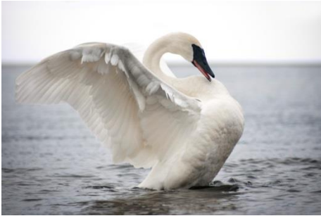
1. Above: a healthy swan in full display.