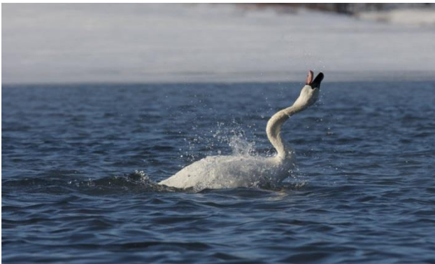
9. Above: A lead poisoned swan has repeated head shaking. This is symptomatic of neurological damage. I have also seen a lead poisoned cygnet repeatedly scrape its head on the ice.