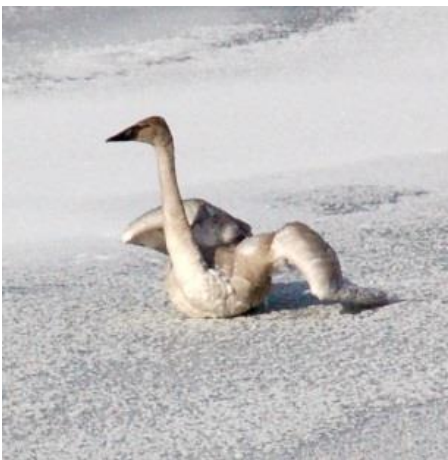
2. Above: The lead-poisoned cygnet swan, described below; starving, unable to use its wings to walk or fly. The cygnet had swallowed a lead sinker as grit.