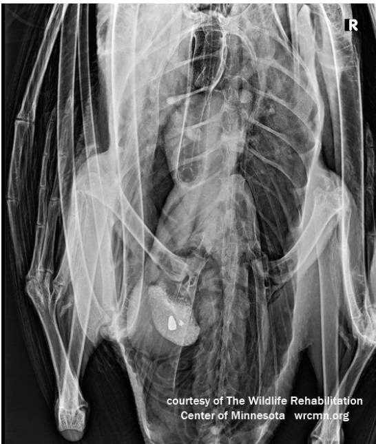
12. Above: Radiogram from the Wildlife Rehabilitation Center of Minnesota of a lead sinker in a cygnet that died from lead poisoning (see photos of cygnet gasping for air, and with green bile).