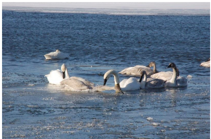
10. Above: Lead reduces the ability of animals to ability to regulate body temperature. Swans freeze to the ice. Wisconsin female swan 00C chips away ice to free a cygnet that has frozen to it. The cygnet was later rescued, taken to a wildlife rehab center, and confirmed to have lead poisoning caused by a fishing sinker.