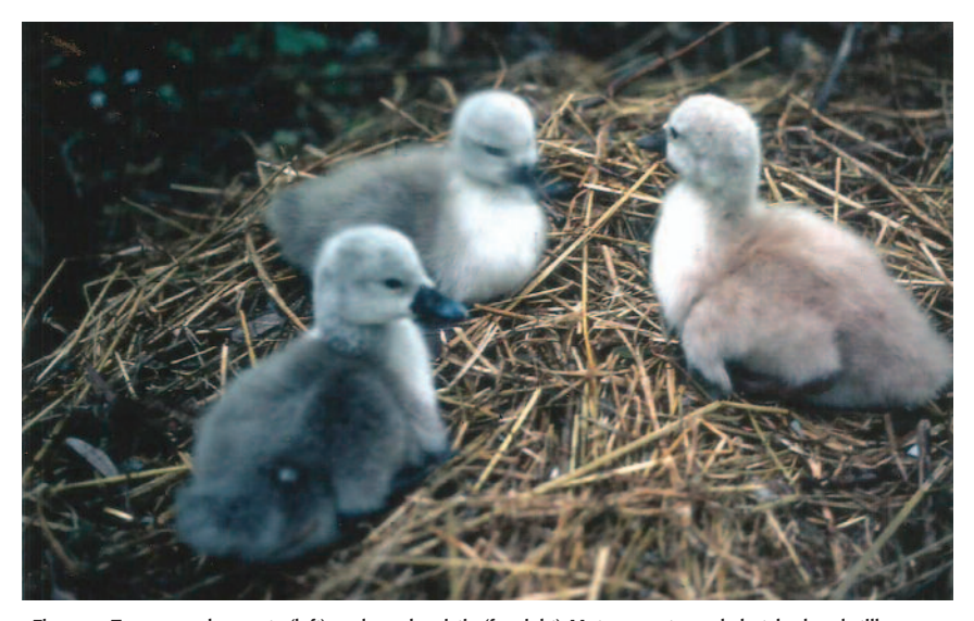
Figure 4. Two normal cygnets (left) and one leucistic (far right) Mute cygnet, newly hatched and still on the nest.

The parents of both Trumpeters and Mutes are remarkably sensitive to the colour of their newly hatched cygnets.