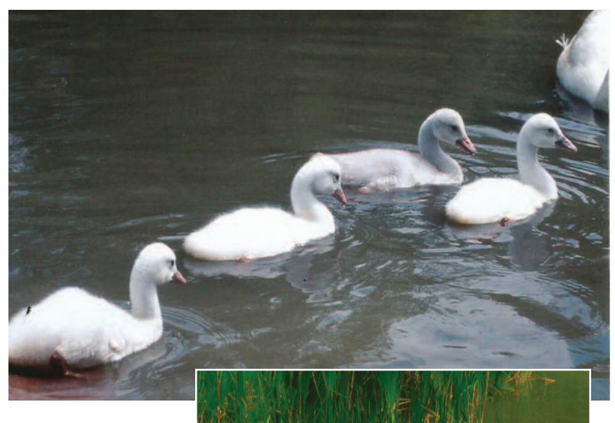
Figure 2. One normal (grey) and three leucistic Trumpeter Swan cygnets (white) in primary down about 10 days old.