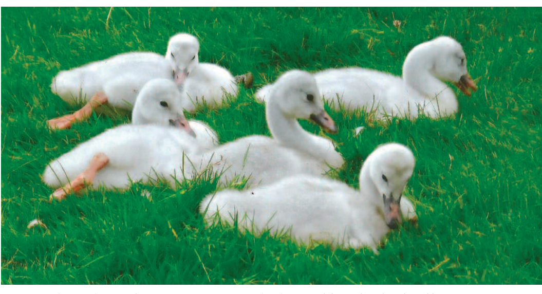
Figure 1. Five normal grey Trumpeter Swan cygnets in primary natal down, about four days old.

feet of subadult and adult leucistic Trumpeters in Yellowstone National Park. Banko (1960) found none at Red Rock Lake National Wildlife Refuge in Montana and leucistics do not seem to have been recorded in the Pacific population in Alaska.