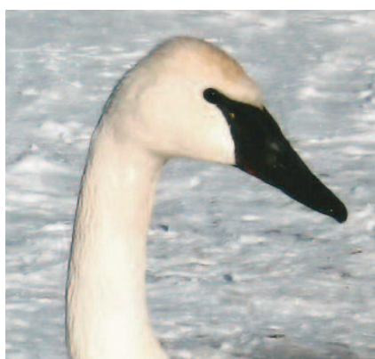
Figure 6. At 25 months, leucistic male C04 had yellow spots on the lores near the gape and at the nostrils. These markings were asymmetrical. A: right facing, B: left facing.

Figure 7. Left: At 30 months, leucistic male #091 showed only one tiny yellow spot at the lores.